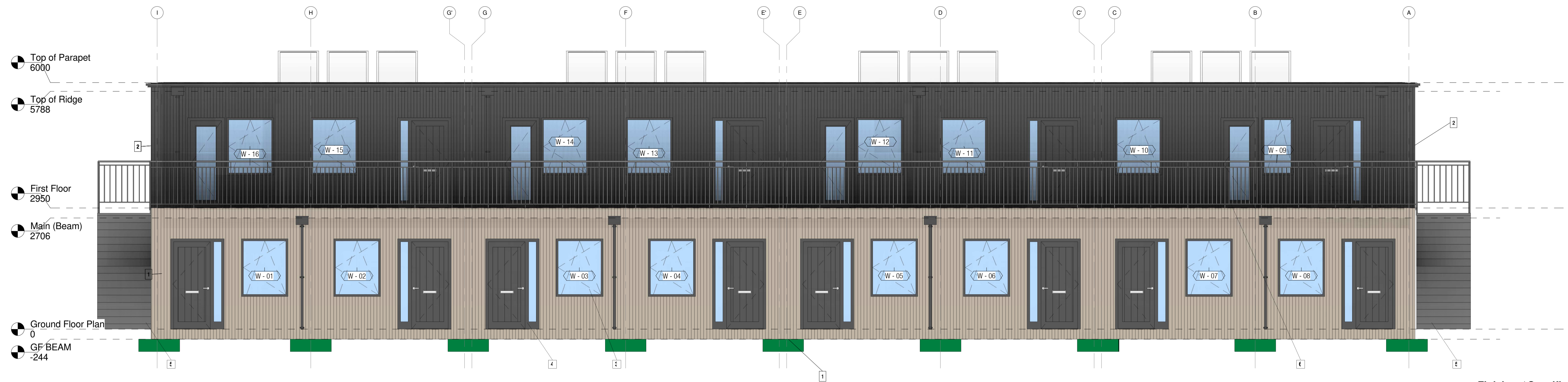
1 Front Elevation 1 : 50